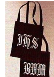
Lay Carmelite Ceremonial Scapular

Phase IV: Ongoing Formation ( part of the community meetings )