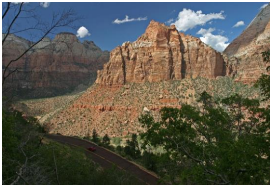
Mount Carmel in the Holy Land

The challenge of Carmel is to see God's presence in prayer while living an active, busy life in the midst of the world.