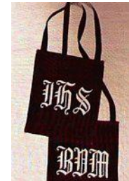
Lay Carmelite Ceremonial Scapular

Phase IV: Ongoing Formation ( part of the community meetings )