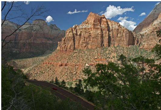
Mount Carmel in the Holy Land

The challenge of Carmel is to see God's presence in prayer while living an active, busy life in the midst of the world.