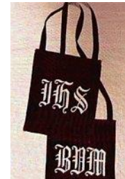
Lay Carmelite Ceremonial Scapular

Phase IV: Ongoing Formation ( part of the community meetings )